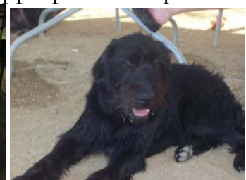
A few of the many shelter animals fostered by PAWED members and then adopted to good homes!