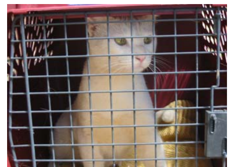
Cats and other small animals are best transported in crates or cages.

*Note: barriers protect dogs from being thrown into the front of the vehicle, however they still can be tossed around in the back.