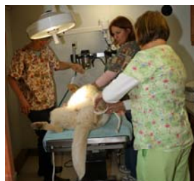
Getting ready for the first big dog