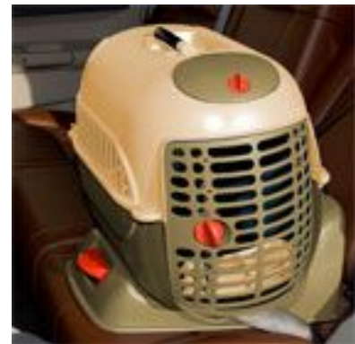
Crate secured to seat with seatbelt, or larger crate in back of vans/SUVs.