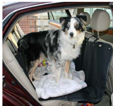
Hammock and harness.