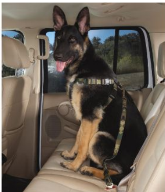
Harness that secures to car seatbelt

Below are some options available to restrain dogs in cars, and you should chose a system that works best for the size and type of dog and your lifestyle. For cats and other small animals, crates or cages secured with a seatbelt offer the best safety. Keep in mind that if you have a passenger air bag, it can be deadly to a pet riding in the front seat unless you have disabled the system. It is generally thought to be safer and less distracting if your pet is secured in the back seat/back area of the car/van. For pets transported in the back of an open bed truck, fortunately California law (Vehicle Code Section 23117) now requires that the pet be cross tethered to the vehicle or protected by a secured container or cage, in a manner which will prevent the animal from being thrown, falling or jumping from the vehicle.