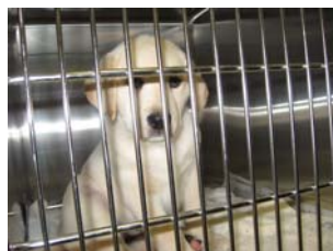
Feeling drowsy awaiting surgery