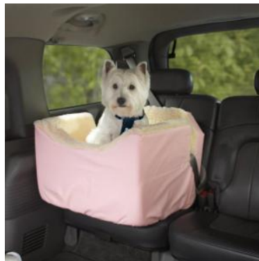
Booster seat with harness (small dogs only)