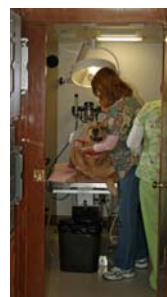
Groggy Scarlett before re-suture of wound.