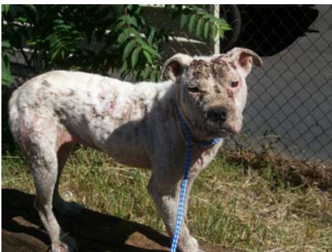
Willow—BEFORE—when arriving at the shelter June 2011