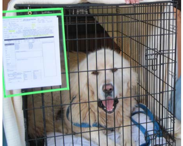
Polar—one of the first clinic clients saying “Thank You PAWED!”

Bringing this service to the first selected outlying community was the result of five years of planning and hard work by dedicated PAWED members/volunteers who knew that affordable and accessible spay/neuter services were very much needed in the outlying areas of the county. We obtained, totally renovated, and purchased equipment and supplies for the mobile clinic, and recruited and scheduled an ALLVOLUNTEER staff. This was a monumental accomplishment: the first mobile spay/neuter clinic service in El Dorado County!